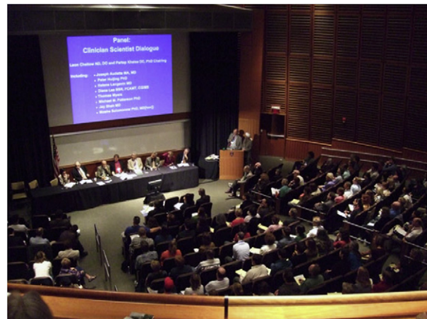
Figure 4 The Clinician–Educator/Scientist panel.