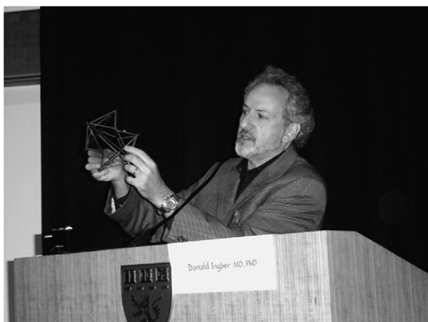
Figure 2 Donald Ingber, MD, PhD, describes the tensegrity model.

Boris Hinz, MER, PhD, addressed the evolution, mechanoregulation, and contractile function of myofibroblasts. Myofibroblasts are atypical fibroblasts that combine the ultra-structural features of both fibroblasts and smooth muscle cells. Due to their expression of stress fiber bundles containing alpha smooth muscle actin, and due to strengthened adhesion sites on their membrane, these cells possess a much higher contractile potential than normal fibroblasts. The contribution of myofibroblast contraction in wound healing is well established; however, more recent discoveries of the presence of myofibroblasts in other connective tissue, such as broad fascial sheets, has provided early evidence that connective tissue contractility is also an important factor in normal musculoskeletal dynamics.